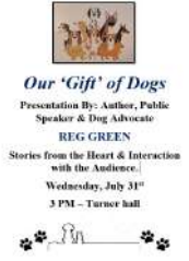
Dog Presentation on Wednesday, July 31st 3 PM Turner Hall