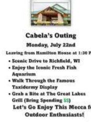
Cabelas' Outing on Monday, July 22nd 1:30 PM - Bring Payment Method