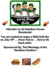
Grill-Out on Thursday, July 18th - Noon - Back Patio