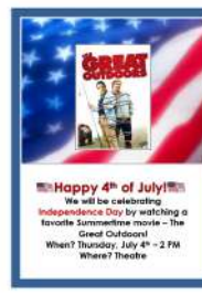
Great Outdoors Movie on Thursday, July 4th 2 PM - Theatre