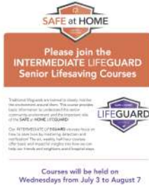
Next Lifeguard Course begins on Wednesday, July 3rd 1 PM Well. Rm.